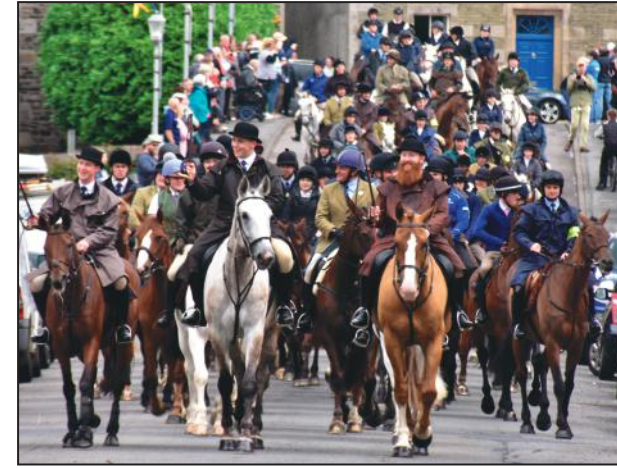
A FINE SIGHT: The cavalcade makes its way along Thomas Telford Road