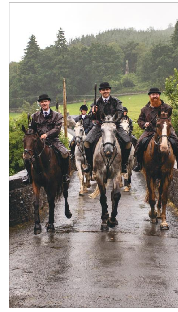
DAMPISH!: Crossing the Benty Brig as they leave for home