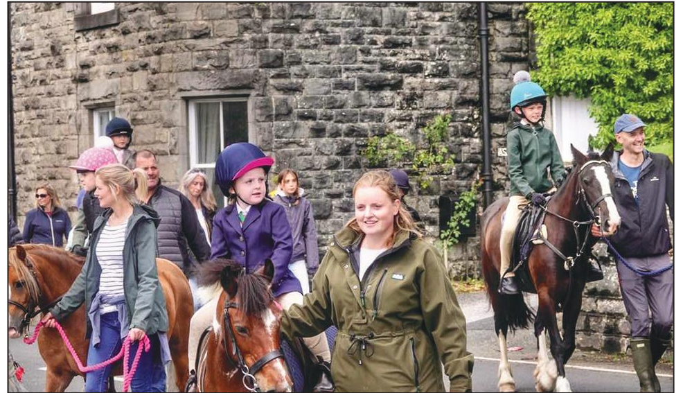
FAIR CHUFFED: The Castle Craigs Committee was delighted with the number of riders and followers that turned out for the annual Pony Rideout. It gives the children of the town a chance to follow the Cornet in their own special ride before returning to the Castleholm for an afternoon of fun at the Fun Day organised by the Xcel Project and Castle Craigs Club