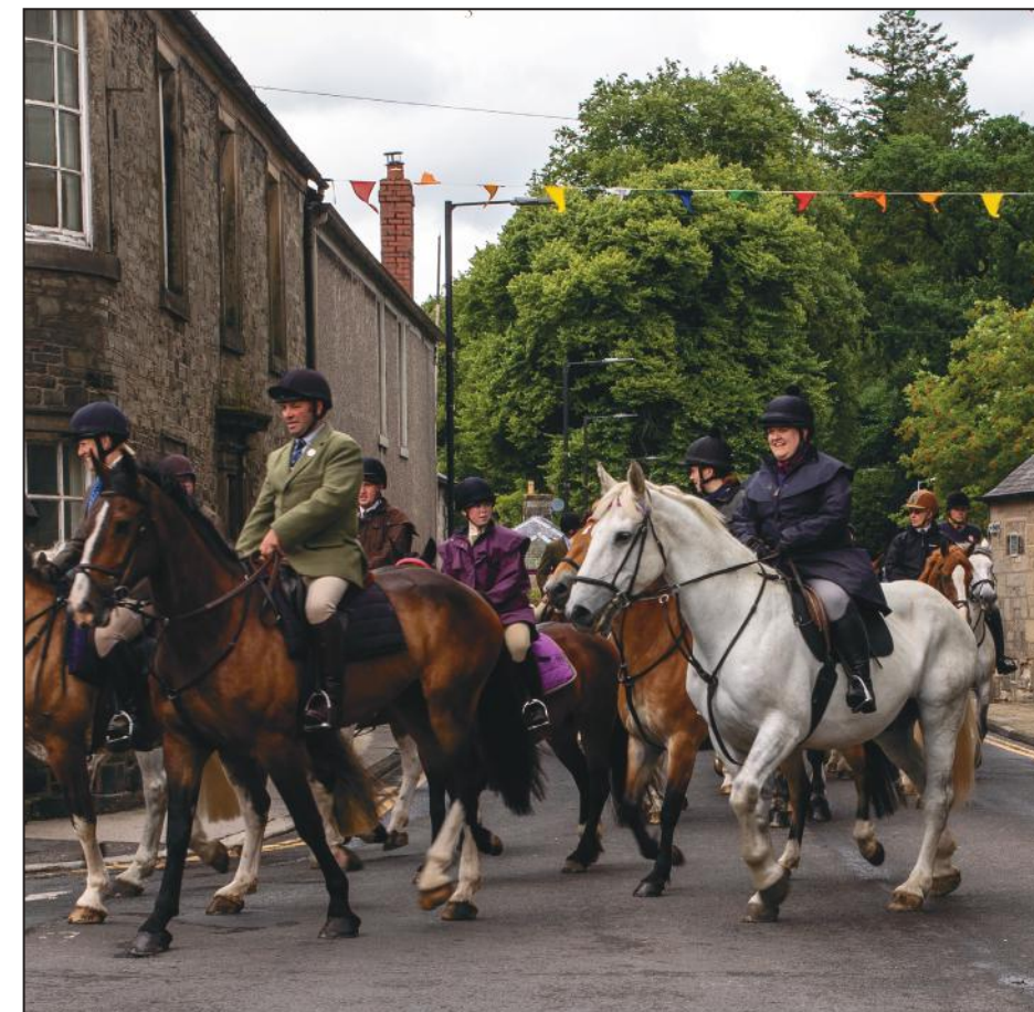
FOLLOWING ON: The riders set off on the lengthy ride over the hills