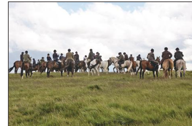
MUSTER: A pause for breath on the way