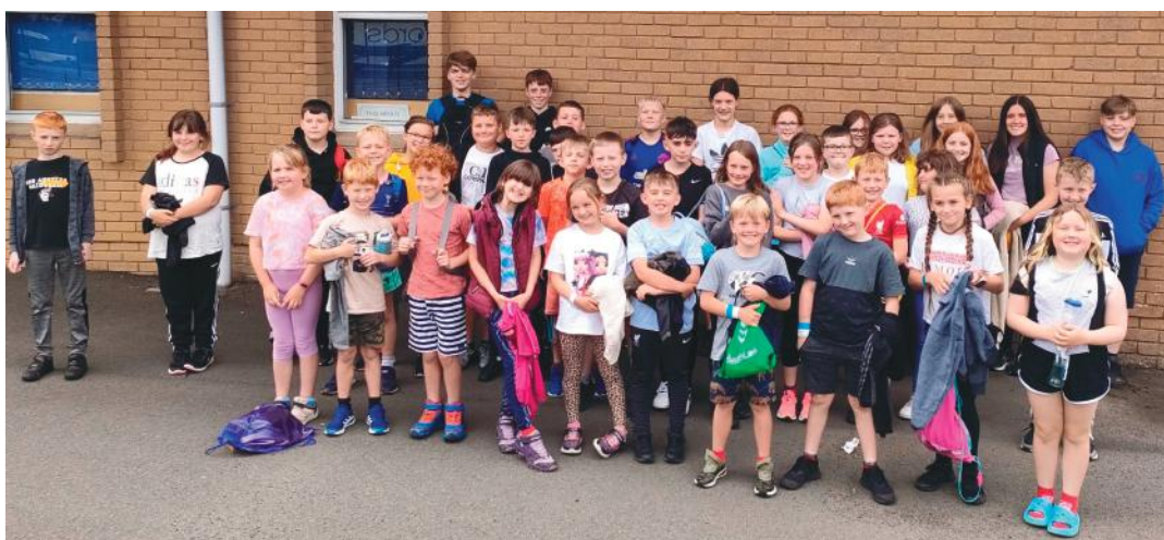
Below: BOUNCING: Heading off for Fusion Trampoline Park