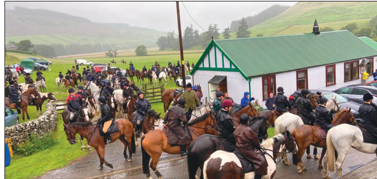
LOOKING FROM A WINDOW ABOVE: A slightly different aspect of the horses leaving The Benty