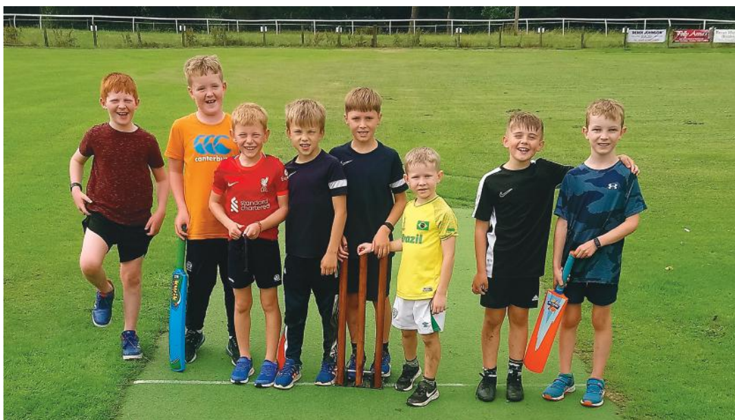
Above: HOWZAT: Cricket training at Langholm Cricket Club

In AOB, a discussion confirmed that no changes are to be made in charges for subscriptions or coffee at meetings. A vote of thanks for the outgoing president closed the meeting until the next Probus Club in September, with a reminder to members of the departure of the annual excursion on 11 July.