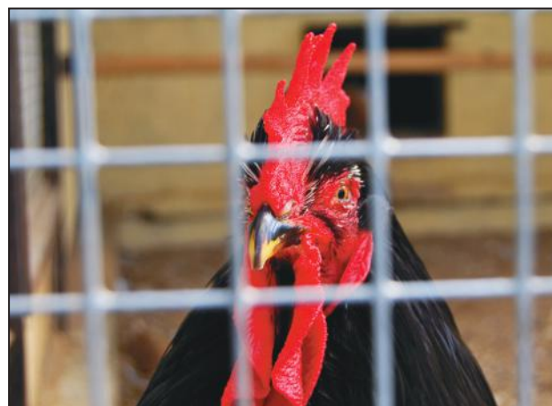
WELFARE: Will the new trade agreement see battery-hen eggs back on UK supermarket shelves?

"Scotland's farmers, crofters and producers welcome opportunities to improve trade overseas but only on fair terms, that reduce risk to our food security and above all protect the