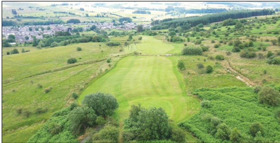
ATTRACTION: The money will be used to create new mountain bike trails and to upgrade and reopen old tracks to complement the existing network.