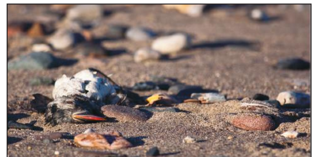
WARNING: Scottish Borders Council has issued a warning after hundreds of dead seabirds were found on beaches.

being advised to take precautions. These include not touching dead or sick birds; keeping pets and dogs away from birds; not feeding wild waterfowl and not touching surfaces contaminated with wild bird droppings.