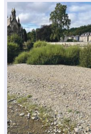
MASSIVE: The gravel build-up at the side of the River Esk