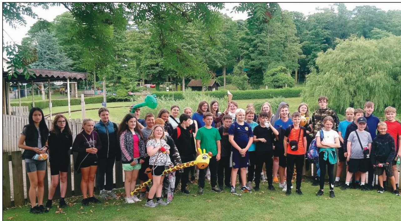
SQUAD: Enjoying a great day out at Lightwater Valley Adventur Park in North Yorkshire

We are not even halfway through the holidays and there is plenty more still to come.