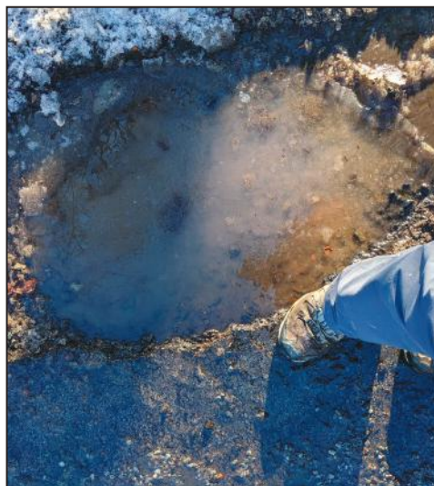
CRATER: One of the deep potholes on the Gilnockie road