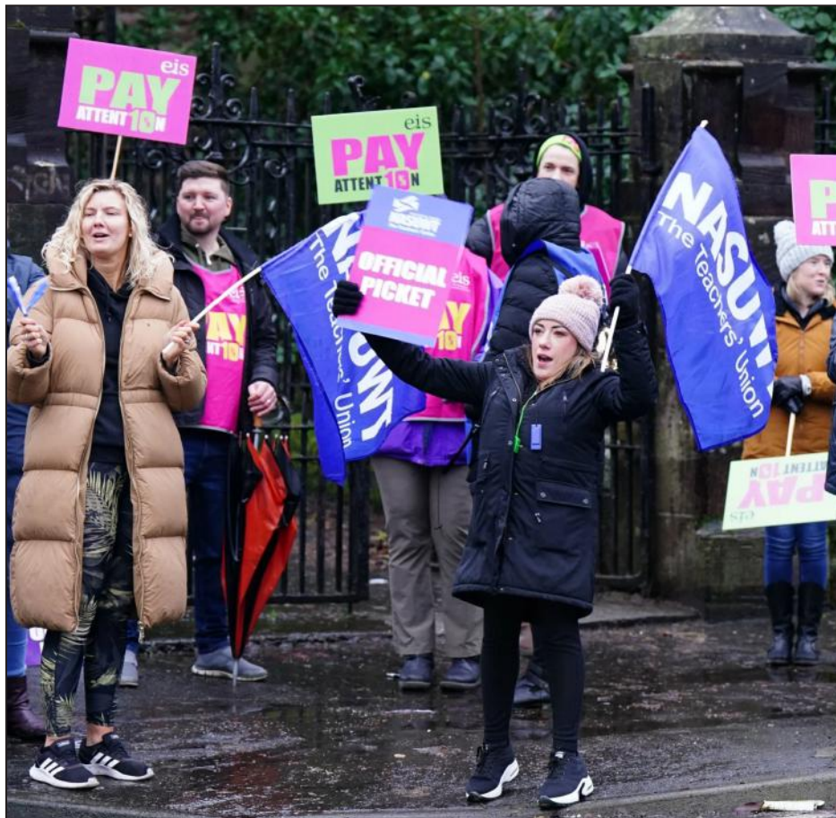
PICKET LINE: Teachers across the region are coming out on strike later this month over a 10 per cent pay claim.

"We remain absolutely committed to a fair and sustainable pay deal."