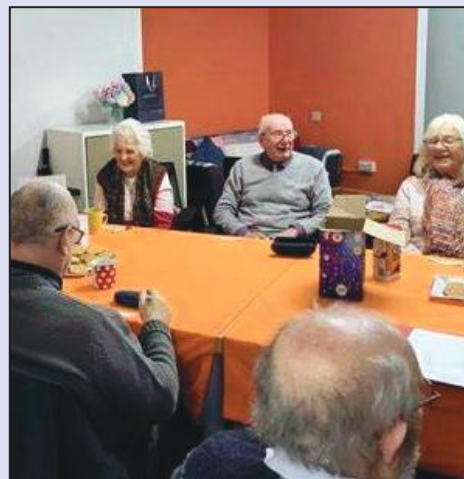
COSY: Warm spaces provide much needed comfort

A spokesman said: "The fund has been launched to support voluntary, community and charity organisations to provide a warm