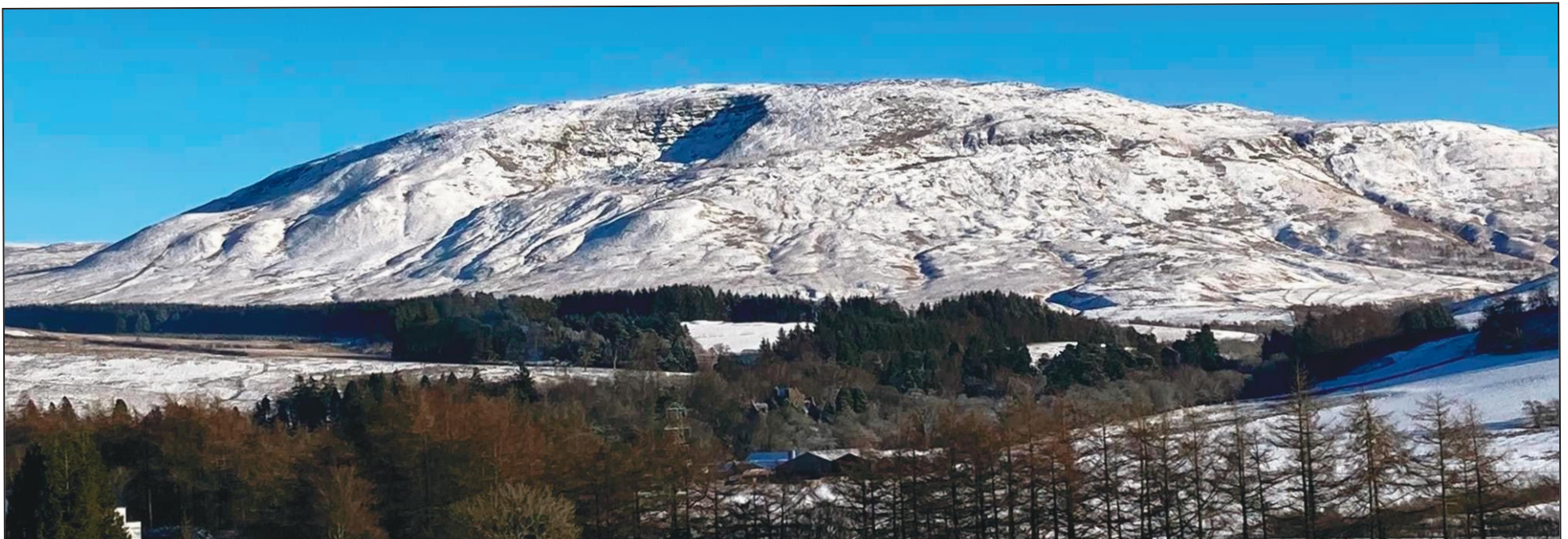
SNOWSCAPE: As temperatures plummeted across our region this week, the reward was stunning scenery like this panorama of a wintry Ewes Valley seen under beautiful clear blue skies.