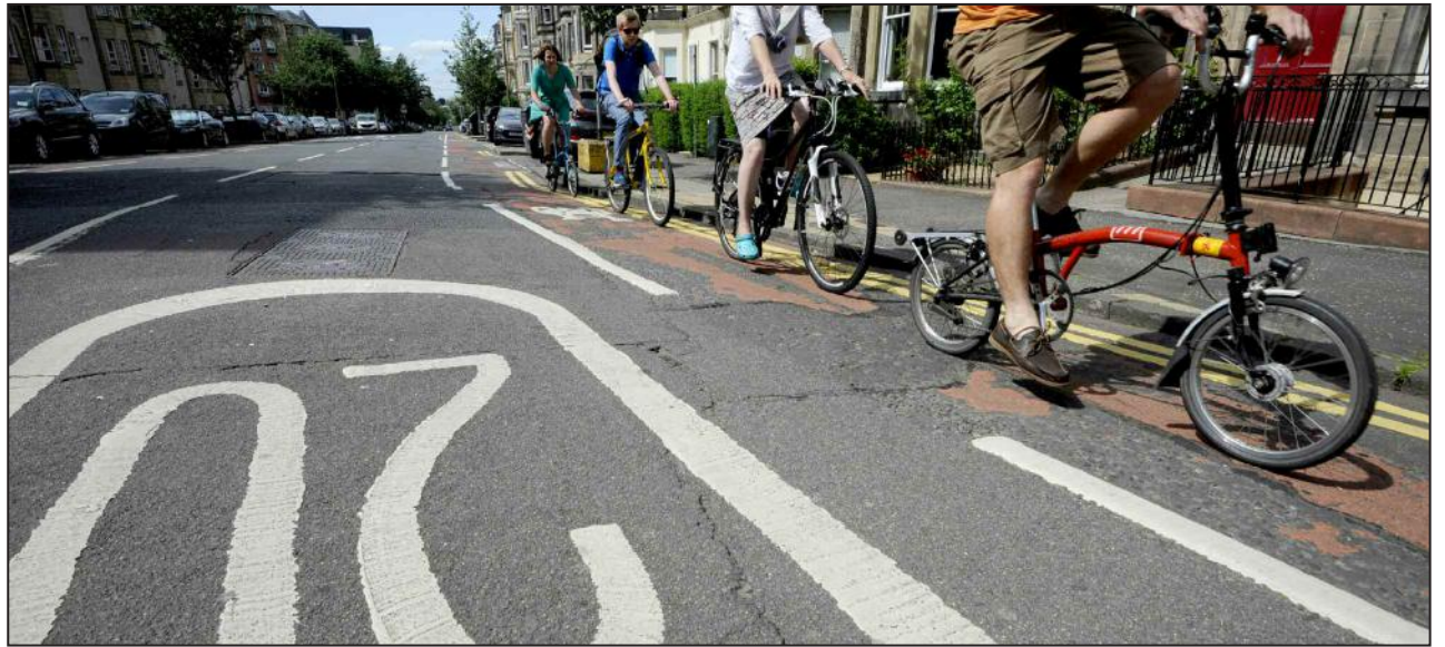
SLOW LANE: 20 mph might be ideal for cyclists, but frustrated motorists claim the new speed limits are a danger

The report also anticipated that the reduced speed limits would not go down well with everyone.