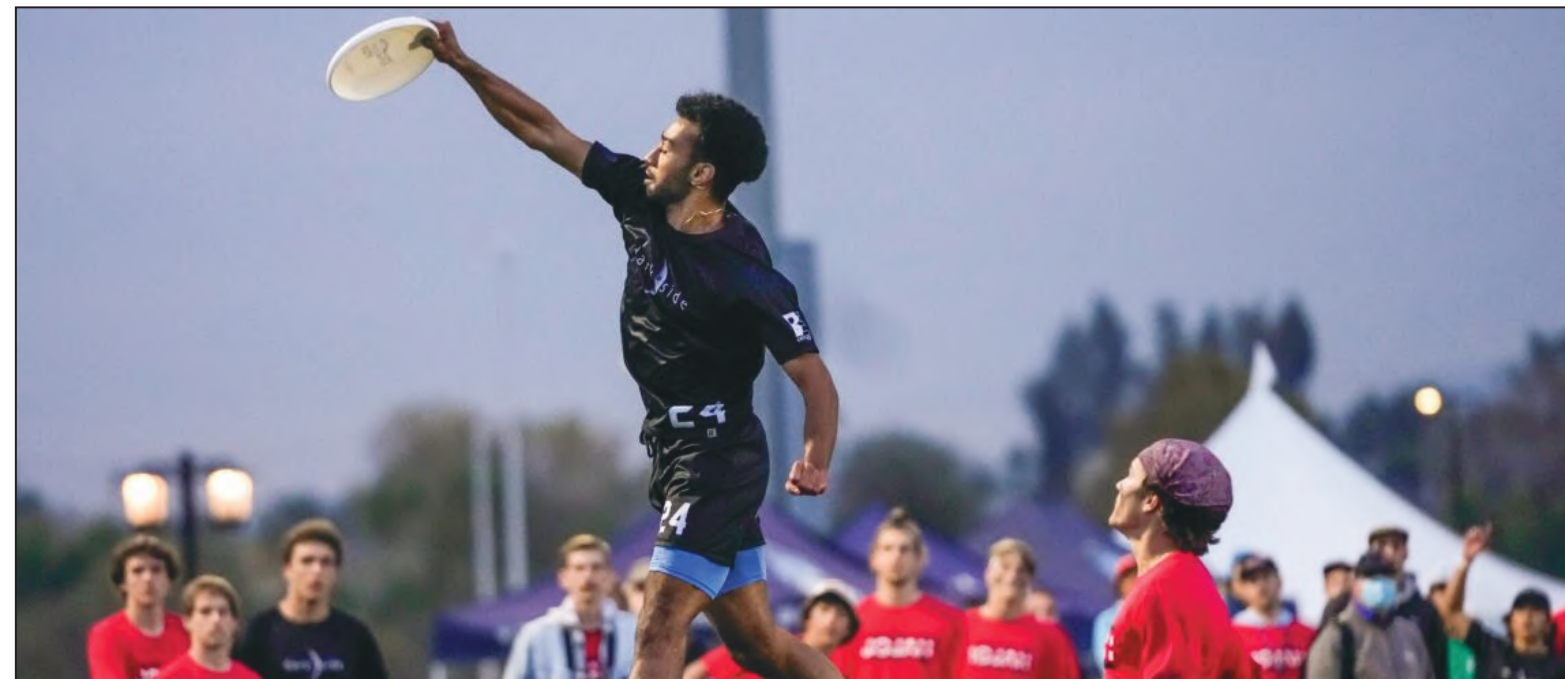
INTERNATIONAL: Ultimate Frisbee was invented in the United States and has since grown to become a global sport, played by thousands of people.

disc made of flexible polypropylene plastic. (This would become the Frisbee we now know and love – the name itself was coined by students at Yale and derives from the Frisbie Pie Company in Connecticut).