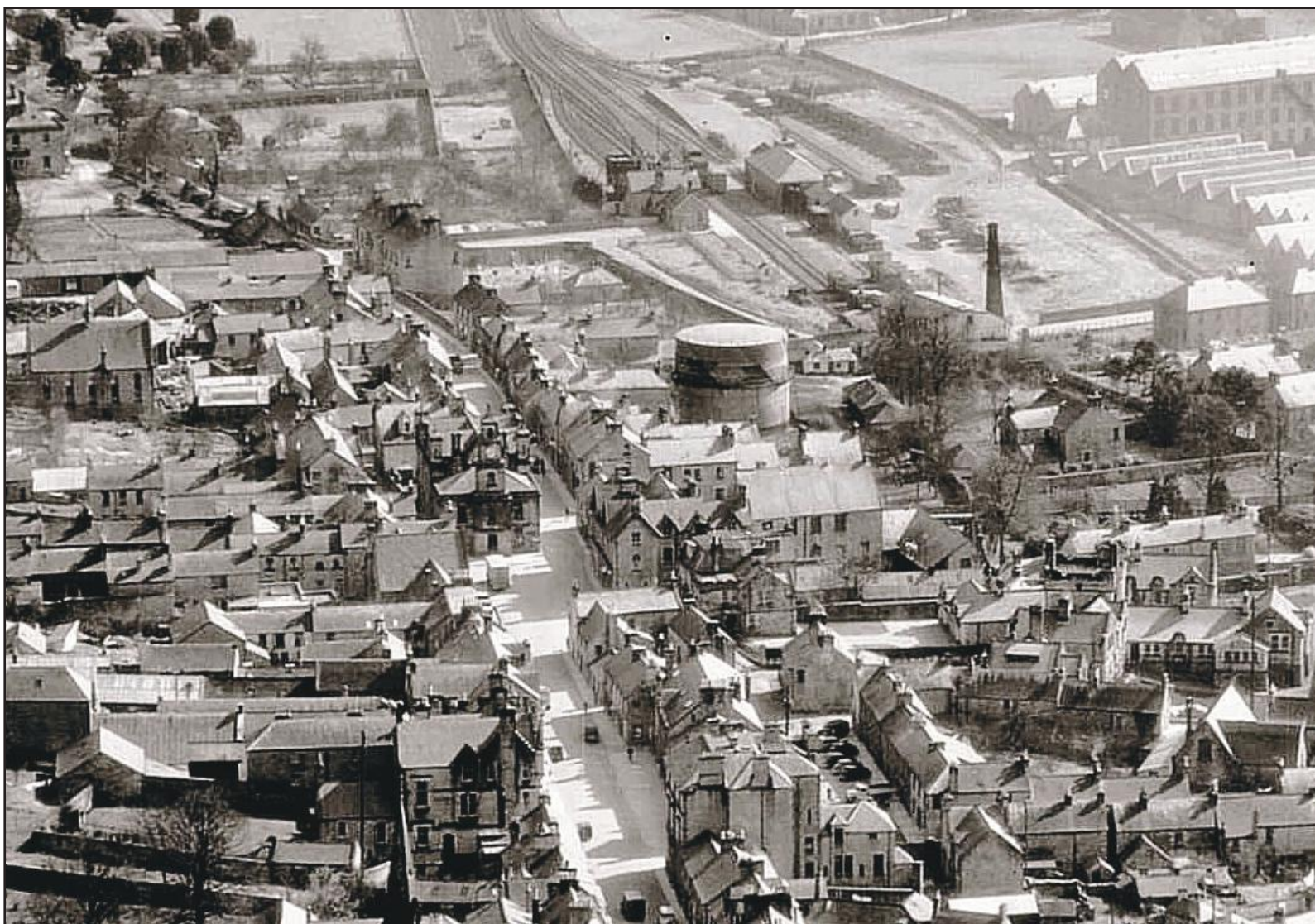
The second of the aerial photos Stuart Tedham came across. This time, a fabulous aerial view of Langholm Old Town from April 3, 1950. Eric Edwards digitally enhanced the photo From NCAP - National Collection of Aerial Photography