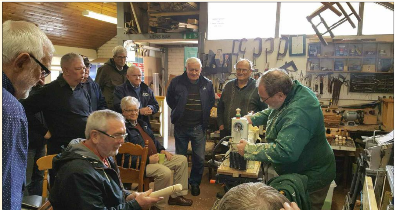
VITAL: Men's Sheds, like this, can help tackle isolation and loneliness

"Men's Sheds help tackle isolation and loneliness, with the movement being described as one of the greatest mental and physical health developments in a generation."