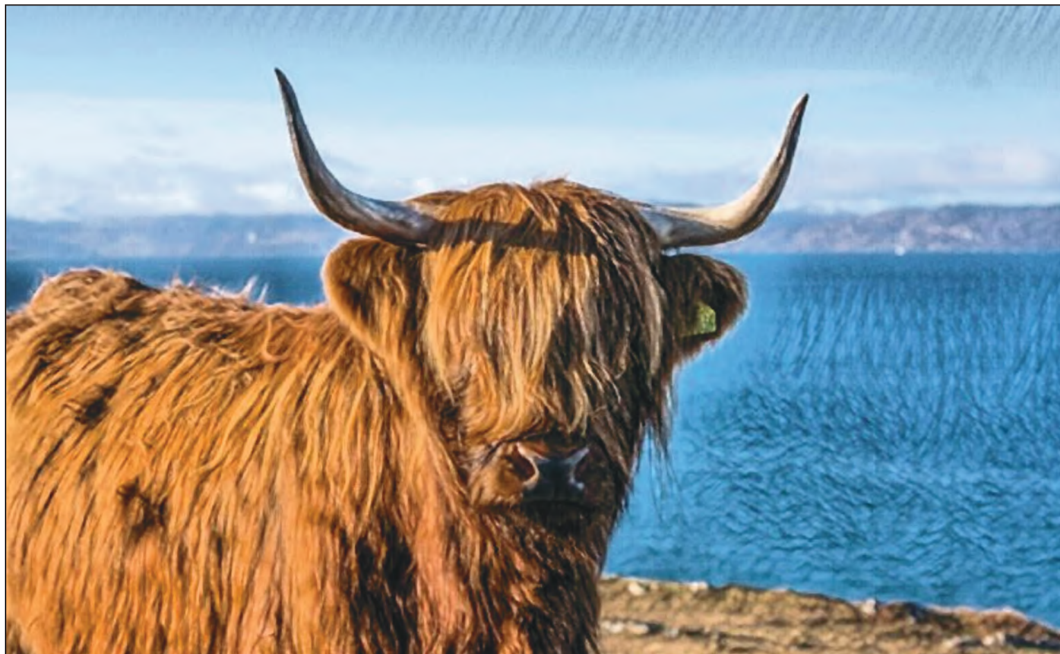
TALENTED: Some examples of Chloe's work, below