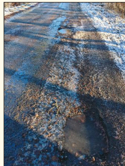
CRATER: This foot-long pothole is just one of the many blighting the B6357 road at Gilnockie